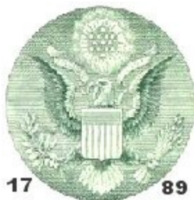
17 89 Great America Seal