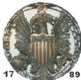
17 89 Georgetown Seal