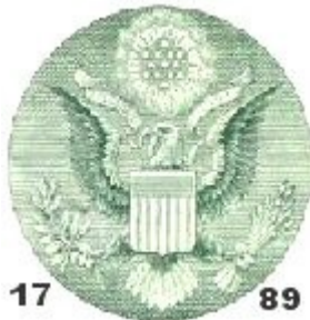
Great America Seal

Jesuit John Carroll was an intimate of Washington. He wrote a prayer at the time of Washington's inauguration asking God's blessing on the president, Congress, and government of the United States — a prayer still very much in use today. Out of gratitude for John Carroll's support during the war, Washington gave a modified version of the seal of the United States to the institution that is now Georgetown University, and that seal is still in use. Or it could be said: John Carroll gave the seal to George Washington. The two seals are are similar and the likeness is very self evident.